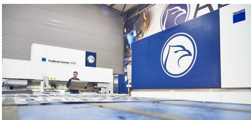
<p>Most up-to-date technologies: Worker with the TruBend Center 5030</p>