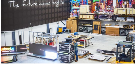
<p>Tailor-made: Apametal develops and builds each digital sign itself.</p> – Frederik Dulay-Winkler