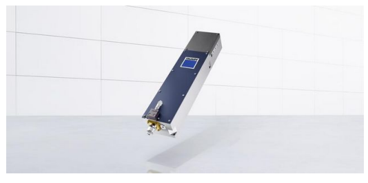
The TOP Cleave optics spread the power of an ultra-short pulse laser along the beam axis, creating a focus line. This increases by a hundred-fold the speed of separating glass using material modification, to one meter a