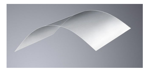
Outstanding edge quality in ultra-thin glass.