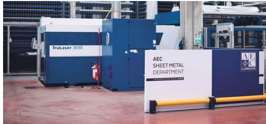
The TruLaser 3030 fiber 2D laser-cutting machine laid the foundations of AEC Illuminazione's close partnership with TRUMPF. Its connection to an automated storage system made production much faster.

achieve this, Bianchi has now connected up 85 percent of the company's machines. The MES generates production schedules and ensures smooth operation of the manufacturing environment. The design engineers can send their CAD drawings straight to the machines, where the data is imported and turned into finished parts as and when they are needed. The MES also collects machine data and key metrics for quality monitoring, machine utilization and production status. "By connecting everything together, we've created a truly transparent production environment. Tailoring our production schedules to the needs of our employees and machines helps to shorten throughput times and improve on-time delivery over the long-term," says Bianchi.