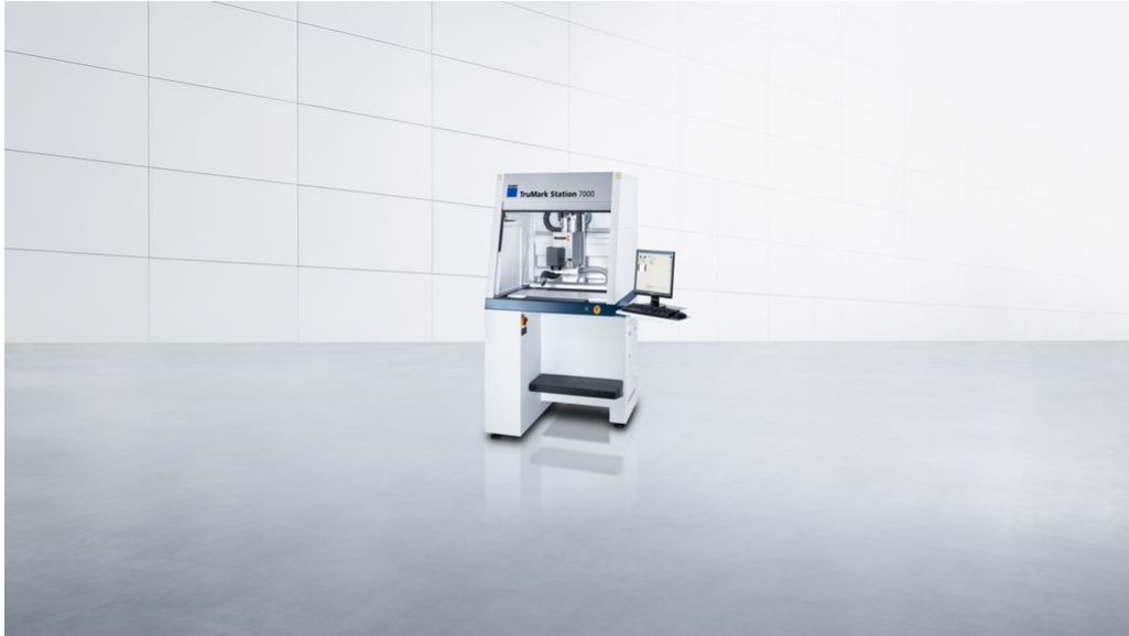
TruMark Station 7000

TruMark Station 7000 is a high-precision, multi-axis turning center designed for manufacturing complex, high-precision parts. It features a large, rigid cast-iron structure and a high-speed spindle, providing exceptional accuracy and productivity. The machine is equipped with a variety of tooling options, including turning, drilling, and grinding, making it a versatile solution for a wide range of applications. For more information, please contact your local TruMach distributor.