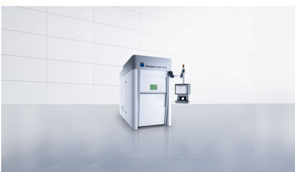
TruLaser Cell 3000

5 TruLaser Cell 3000 (LMD), TruLaser Cell 3000 LMD