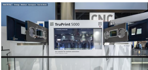
The TruPrint 5000 featuring auto-start

The large-format TruPrint 5000 system featuring auto-start was an eye-catcher. This solution speeds up 3D printing to boost productivity. The Formnext demo showed visitors how the substrate plate with a zero-point clamping system automatically slides into the proper position. Speaking at the press conference, Tobias Baur, General Manager of TRUMPF Additive Manufacturing, said that automated in-machine solutions like this are the first step toward the longer-term goal of automating upstream and downstream stages in 3D printing.