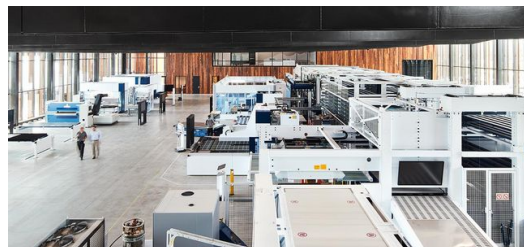
In a production hall measuring 55 meters in length, there is a connected sheet metal production with a central storage system as the centerpiece, which supplies the machine tools with material.