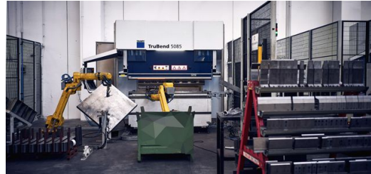
Robot colleague: For the employees at Omas S.p.a., robots have long been part of everyday life.