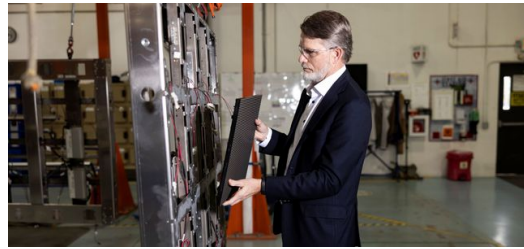
<p> LED </p>