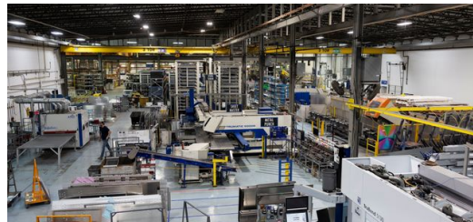
<p>Daktronics ... STOPA ... </p>

... TruMatic 6000 fiber ... TruLaser Weld 5000 ... Kurtenbach ... "TRUMPF ... TRUMPF ... SheetMaster ... STOPA ... ToolMaster ... Daktronics ..."