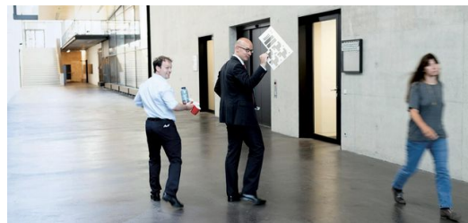
The team of people from the product group, development, purchasing, production, sales, service and project organization departments meets at regular intervals to discuss how development on the TruLaser Center 7030 is progressing.