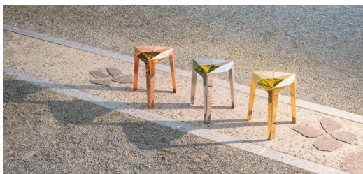
<p>The "Orisu" chair in different colors: a symmetrical object, made of uniform parts and folded metal like origami.</p>