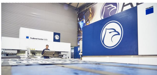
Most up-to-date technologies: Worker with the TruBend Center 5030