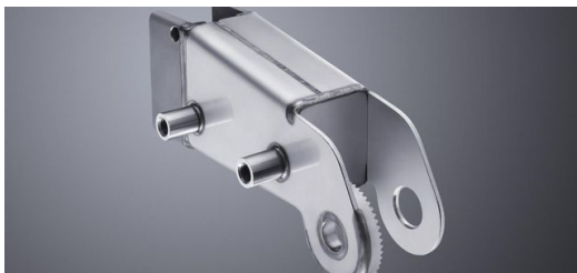
TRUMPF Medizin Systeme setzt in der OP-Tisch-Fertigung auf die Pluspunkte vom Laserschweißen.

This article was first published in May 2014.