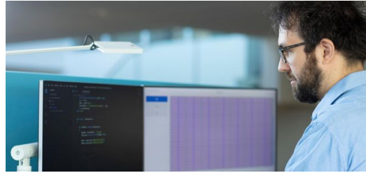
IT specialist Raphael Willgenss deliberately opted for an open ERP system: "I programmed many of the optimizations in the upstream and downstream processes myself."