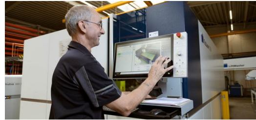
A TruLaser 3030 is loaded and unloaded semi-automatically with a LiftMaster.