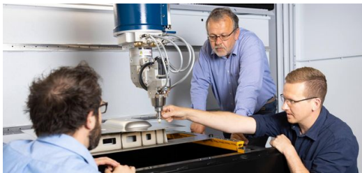
Discussing, arguing and seeking solutions together: the good cooperation between sons and father has taken the company a long way, on course for the Smart Factory.