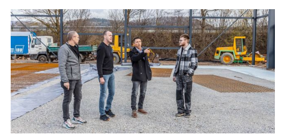
DELO is planning on relocating to neighboring Hechingen in September 2023. Construction work is in full swing. With a developed area of 2,000