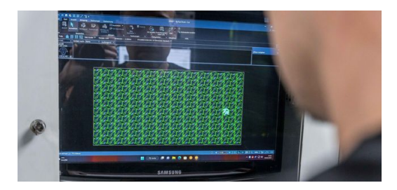
The CoolLine option guarantees consistent temperatures during laser cutting. "This means that we can nest parts much more closely and save material," Denis Lozusic is pleased.