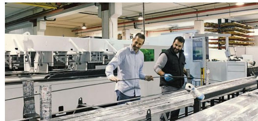
Hydracorte is part of the Caamaño Group, a global network of companies that specializes in building, renovating and fitting out all kinds of retail outlets. As a supplier of metal parts, Hydracorte lies at the start of the production chain and makes just about everything you can think of, from small, fragile parts to fully fledged modules. Their products include signs, furnishings, paneling, facades and plenty more.