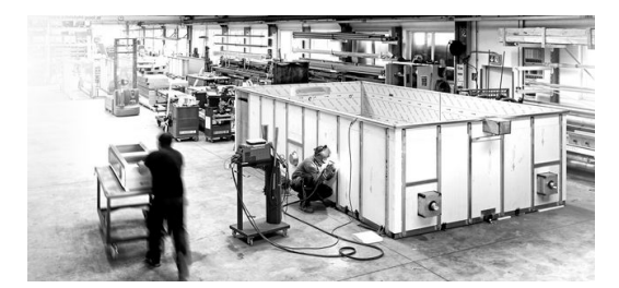
In one piece: Pools with standard dimensions are fully finished at Gassner and transported to the installation site on flatbed trucks.