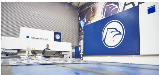
Most up-to-date technologies: Worker with the TruBend Center 5030