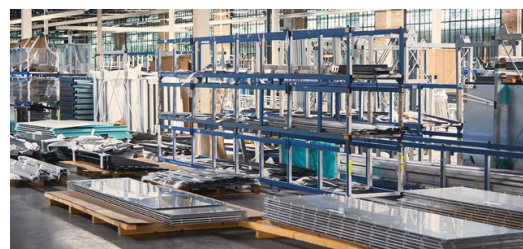
A one-stop service provider: KFK set up its own glass production facility measuring approximately 360 meters long in 2017.