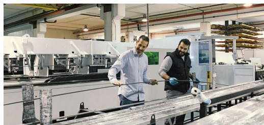
Hydracorte is part of the Caamaño Group, a global network of companies that specializes in building, renovating and fitting out all kinds of retail outlets. As a supplier of metal parts, Hydracorte lies at the start of the production chain and makes just about everything you can think of, from small, fragile parts to fully fledged modules. Their products include signs, furnishings, paneling, facades and plenty more.