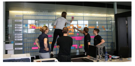
But by using pinboards and workshop boards , the team keeps all the individuals tages and process visible at all times , so everyone is kept up to date on the current status.