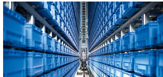
The automated small parts store (AKL) keeps products in 23,000 shelf spots.