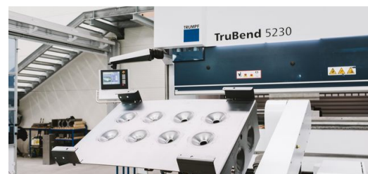
For boiler plate production, half-shell-shaped recesses must be made in the plate. First a hard nut for the TruBend Cell 5000. Today, the bending cell handles the forming process fully automatically, saving a lot of time.