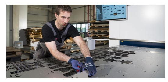
Today, all it takes is a glance at the Sorting Guide screen. The operator is shown a removal proposal on the large screen. All parts that belong to an order are color-coded.