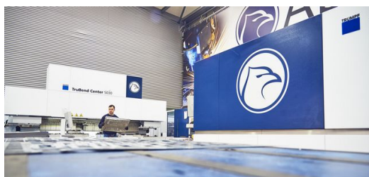
Most up-to-date technologies: Worker with the TruBend Center 5030