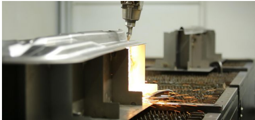
Laser is the only tool able to trim parts made of high strength steels once they have cooled.

the bus division, for example, offers electric buses as well as diesel buses with particularly low emissions. Solar power plants, battery energy storage systems and electricity infrastructure are on the agenda at JBM in the renewable energies division. With this line-up, JBM is able to meet strict sustainability requirements.