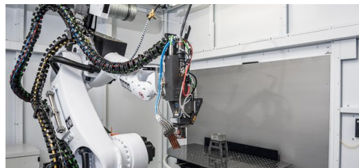
The laser network, serving a TruLaser 3030 fiber and a TruLaser Robot 5020, expands the range of services offered by SCS by adding laser cutting and welding.