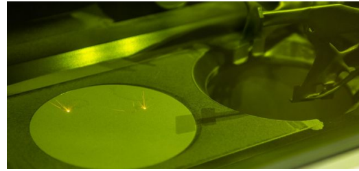
The pulsed laser in TRUMPF's TruPrint 1000 is an excellent choice for creating high-quality surfaces. Its multi-laser capabilities enable highly productive manufacturing processes.