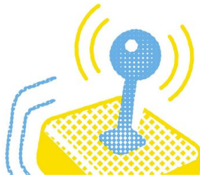
This form of remote control actually feels surprisingly fine. - Gernot Walter

What does the mouse feel about that? Does it sense it is being controlled by someone else? Or does it actually think it wants to run in a circle?