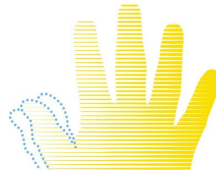
Karl Deisseroth opts to experiment on himself using transcranial magnetic stimulation—his thumb twitches.