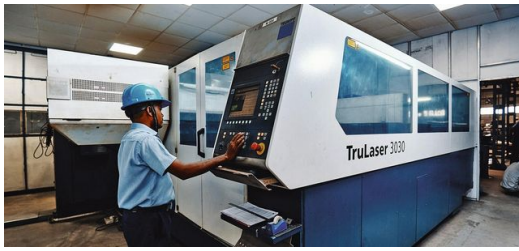
Universal Engineers relies on TRUMPF technology for laser welding of trains.