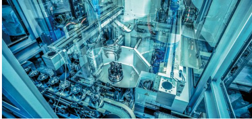
Intelligent production means: the machine finds out for itself what to do.