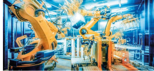
For this to work, the production needs highly flexible, easily controllable tools.