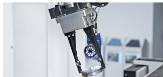
Laser labeling: The labeling helps with the final step, namely order picking and dispatch.