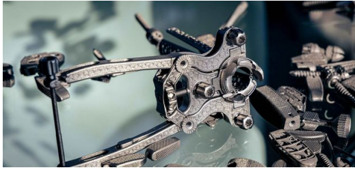
<p>Even complex mechanisms can be integrated into the implants using laser-metal fusion.</p>