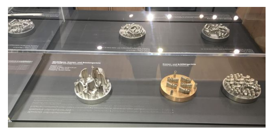
Substrate plates with 3D-printed dental prosthesis.