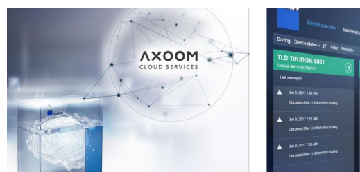
Some of the data is uploaded to the AXOOM Cloud via the Internet.