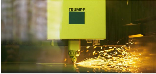
In March, FBT workers started using their new TruLaser 3030 to cut thin sheets and blanks to size.