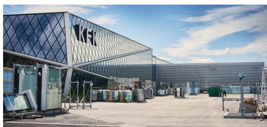
The KFK building in Croatia.