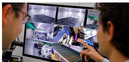
Heating the glass coating very briefly to a high temperature is an essential part of the hardening process. The glass experts at Saint-Gobain spent five years working on their rapid thermal processing method.