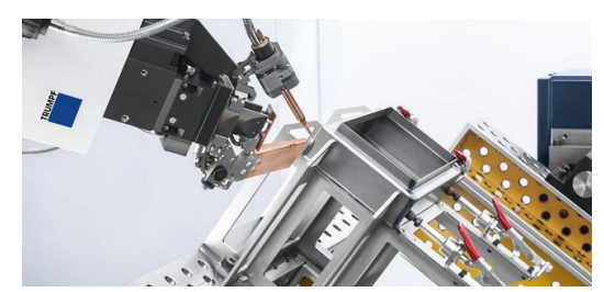
The FusionLine joining technique can be used to join parts, even when this involves the bridging of gaps. It smooths out any unevenness during the welding process and closes gaps up to one millimeter wide. That makes it possible to use the laser on many parts that were originally designed for conventional welding methods.

Exploiting the full potential of laser welding