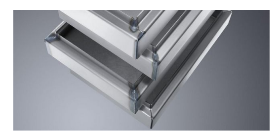
Mild steel terminal box (from bottom to top): unwelded, manual MAG weld, FusionLine weld, and laser weld after redesigning for laser processing.

What is more, the FusionLine function allows operators to join components that are not optimized for laser welding and, for instance, to uncover cracks. The results obtained with FusionLine far exceed conventional welding both in terms of the weld seam quality and the speed of execution.