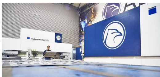
Most up-to-date technologies: Worker with the TruBend Center 5030