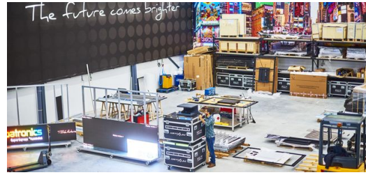
Tailor-made: Apametal develops and builds each digital sign itself.