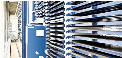
The modern high-bay storage system is based on the latest advanced technology and was the first step toward digital connectivity. Suitably integrated software interfaces are now being added in gradual stages.