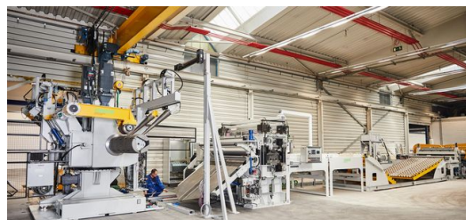
As well as the TRUMPF VarioPress 500, Wagner has also invested in a new decoiling system.