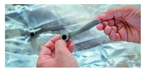
All one piece: Redesigned by Bionic Production, this nozzle offers gentle curves straight from the 3D printer.

The new nozzle is efficient in many different respects. The flow of coolant has been optimized, reducing pressure losses by up to 20 percent. That means you need a lower pressure - and less energy - to achieve the specified coolant exit velocity. The curved channels and optimized jet trajectory take the lubricoolant to the precise place it is needed, delivering no more and no less than is required to carry out the process in an optimum manner without causing thermal damage to the part. This reliable and automated solution for delivering lubricoolant eliminates factors that may have previously caused hold-ups in the manufacturing process.