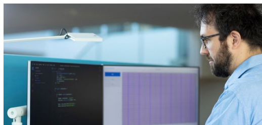
IT specialist Raphael Willgenss deliberately opted for an open ERP system: "I programmed many of the optimizations in the upstream and downstream processes myself."