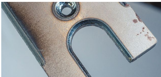
The technology is hugely helpful with thick sheets: EdgeLine Bevel can process sheets up to eight millimeters thick.

EdgeLine Bevel opens the door to new types of parts that used to be virtually inconceivable. If users wish to bend parts and then use heat conduction welding to weld them to a part with a circumferential, visible seam without rework, current laser-welding processes limit them to thin parts made of sheet metal no more than two millimeters thick. The part must be cut so that the material that the laser melts during welding does not protrude too much. In addition, it can only be 70 percent of the sheet thickness used, which is why this method only works with thin sheets. If the part has bevels, it is possible to leave more material protruding, thereby raising the limit to three to four millimeter-thick metal. This new flexibility in laser welding gives designers more creative freedom to design innovative components. It also simplifies the joining process.