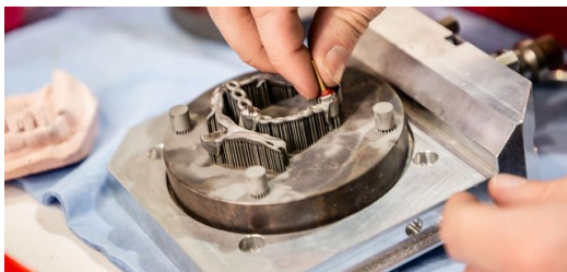
The telescopic crown is built up layer by layer from the powder bed. After this step, the crowns match the geometry of the primary coping almost perfectly, apart from a minimal amount that has to be milled off the inner surfaces.