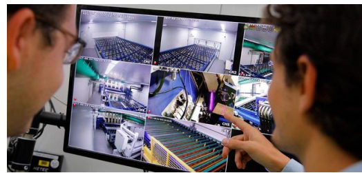
Heating the glass coating very briefly to a high temperature is an essential part of the hardening process. The glass experts at Saint-Gobain spent five years working on their rapid thermal processing method.