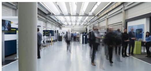
Visitors also crowded to the 2D laser cutting machines.