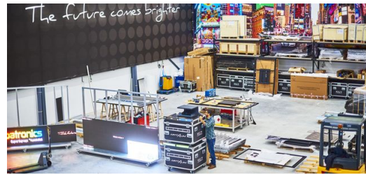
Tailor-made: Apametal develops and builds each digital sign itself.