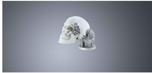
Automated monitoring solutions are indispensable especially in strictly regulated sectors such as medical technology.