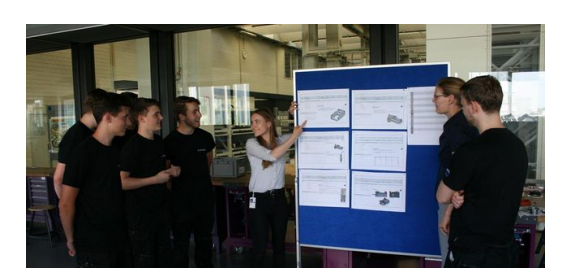
The idea is to actively involve 170 students and apprentices from different departments in the project over the next three years, and to accompany them on that journey.